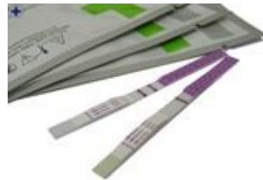
Single Strip Drug Test

It would be advisable to ask the person being tested if they are on any prescription drugs for medical purposes before the test is carried out.