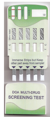
Multipanel Drug Test

Due to the sensitive nature of this drugs test, you must be careful when carrying out the test to avoid contamination and thus inaccurate test results. Please read these instructions carefully before beginning the test.